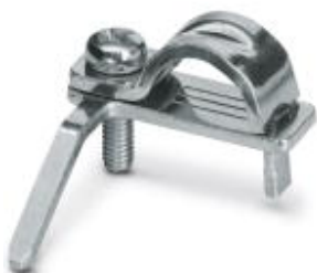
Shield connection clip for printed circuit terminal block

Please be informed that the data shown in this PDF Document is generated from our Online Catalog. Please find the complete data in the user's documentation. Our General Terms of Use for Downloads are valid ( http://phoenixcontact.com/download )